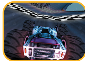
Rollcage ® Stage II (Psygnosis ™ Attention To Detail) with 3D Rendering Array Processor

The undisputed industry leader in 2D and 3D image quality, Matrox has created yet another winner. Offering a full suite of display options and a host of real-world productivity features, the Millennium G450 will change the way you work and play.