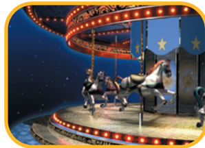
Vibrant Color Quality 2

The Millennium G450 takes advantage of the massive throughput offered by AGP 2X / 4X to deliver fast texturing and data transfer.