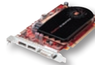
ATI FirePro™ V5700