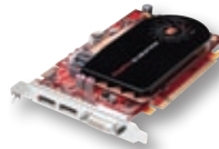
ATI FirePro™ V3750