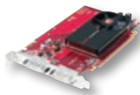
ATI FirePro™ V3700