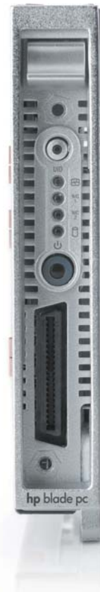
HP bc1000 blade PC