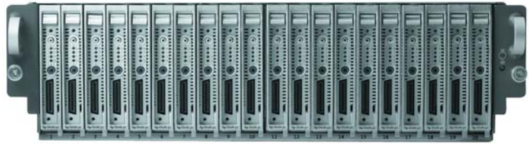
HP bc1000 blade PC

The first criteria was "power." While maximum performance was the goal, low thermal and power requirements were vital. Taylor looked at blades from Sun, IBM, Clearcube, and Dell, but none of their blades were designed as a true desktop replacement – and all required too many kilowatts of power. Too much power would require additional energy output for "cooling," Taylor's second criteria. Because blades produce a great amount of heat, minimizing the thermal requirements on each blade was critical to keep the amount of required cooling as low as possible.