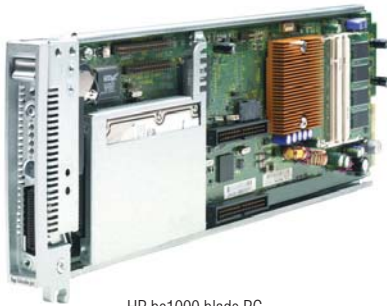
HP bc1000 blade PC

including processors, memory, and network connections on a single circuit board. While server-based computing today mostly exists in a hybrid sense, in that users access some applications via the server and some directly on the user's desktop, the CCI solution would have a blade dedicated to individual users and all applications would reside on the blade. "This approach would enable users to have a dedicated desktop while logged onto the network, but there would be no need for every PC to have a dedicated hard drive, processor, and memory," Taylor observed. He reasoned that with greater computing performance and a simplified client environment, support, maintenance, and management would be easier – and further analysis showed that customers could anticipate saving 25 to 50% on their operating expenses.