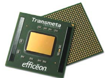
Transmeta Efficéon™ TM8600 Processor