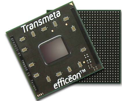
Transmeta EfficeonTM8800 Processor

To maximize performance and responsiveness, the Efficeon TM8800 processor features a 256-bit wide VLIW engine that can issue up to 8 instructions per clock cycle, a large 1 MB L2 cache, and support for MMX, SSE, and instructions for a powerful multimedia experience. The Efficeon processor combines the processor and Northbridge functionality into a single integrated circuit, creating a single package that reduces board space by eliminating the need for a dedicated Northbridge chip. Integrated functionality includes a high-performance DDR memory interface, a 1.6 GB/s HyperTransport™ I/O interconnect, and an AGP 4X graphics interface.