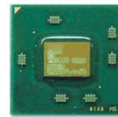
Crusoe TM5700/TM5900 21mm x 21mm

The Transmeta Crusoe processor is based upon a custom efficient instruction set that offers a number of compelling advantages, the most important of which is a reduction in the number of power hungry logic transistors used inside the processor core. This streamlined processor design allows the Crusoe processor to benefit from a greater performance-to-power ratio while keeping heat dissipation to a minimum.