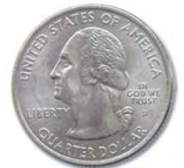
US Quarter 24mm