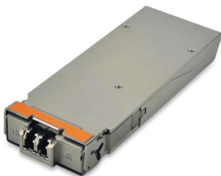
Figure 2. Digital CFP2 Optical Module