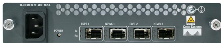
Figure 2. SFP Ports on the transponder

The transponder effectively extends the range of client devices that can connect to the CWDM or DWDM network using pluggable optics: third-party SONET/SDH add/drop multiplexers (ADMs), storage and Ethernet devices, or Cisco platforms that do not support pluggable WDM optics can connect to the WDM network by using this transponder, which operates the wavelength conversion from older 850/1300/1550 nanometer (nm) signals to any CWDM or DWDM channels. This conversion is enabled by the WDM SFP ports sitting on the line side (Figure 2).