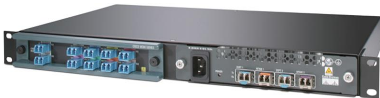
Figure 3. Cisco CWDM chassis

The transponder is compatible with the passive Cisco CWDM chassis (Figure 3) (part number CWDM-CHASSIS-2=). Two transponder devices can coexist together in the two-slot chassis. There is no limit to the number of chassis that can be stacked in a rack. Alternatively, the transponder can coexist in the same chassis with any Cisco CWDM passive filters.