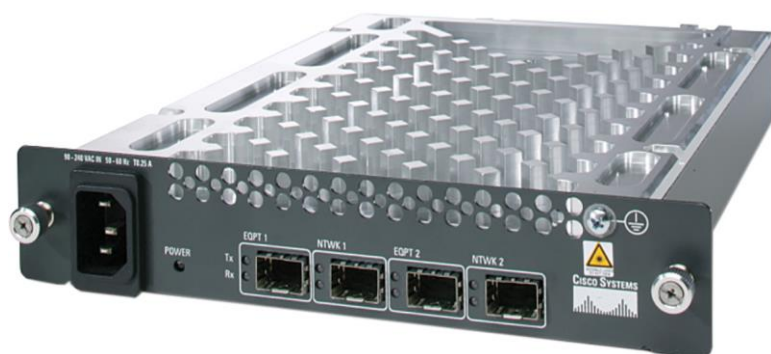
Figure 1. Cisco 2-Channel SFP WDM Transponder

In addition, when Small Form-Factor Pluggable (SFP) devices with the same wavelength reside on client and trunk sides, the unit can be simply used as a 3R regenerator (re-amplification, reshaping and retiming) for the uplink data stream (client to network path) and a 2R regenerator (re-amplification and reshaping) for the downlink data stream (network to client path), turning it into a very dynamic and flexible module.