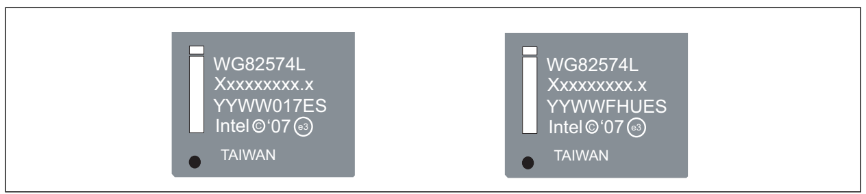
Figure 1. Engineering Samples Top Marking Example With Identifying Marks